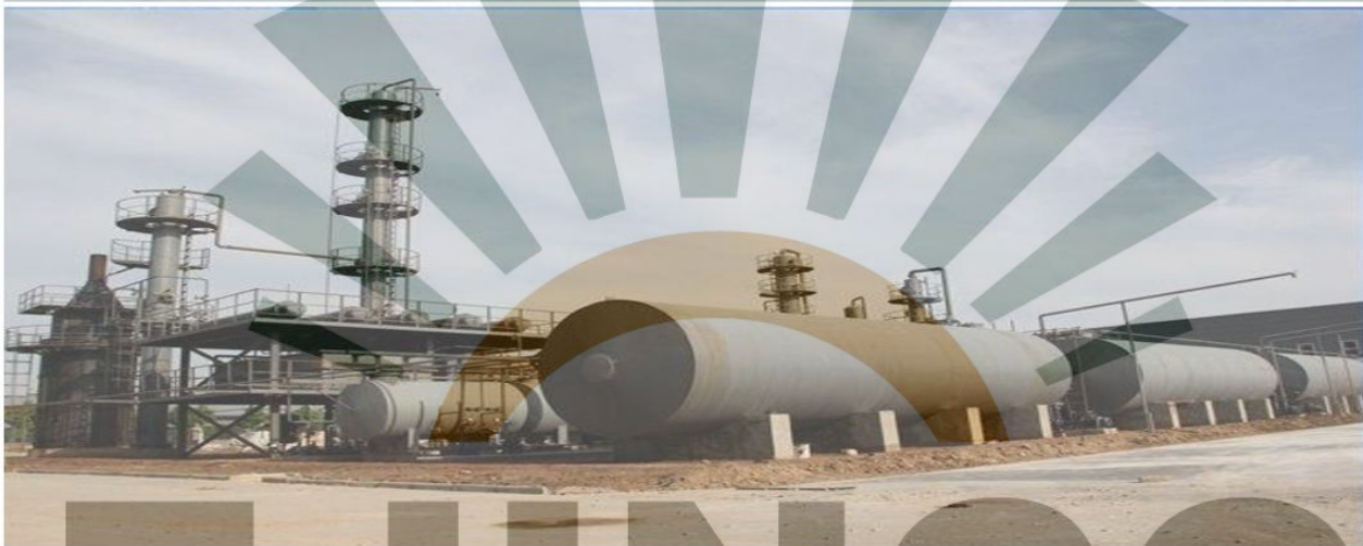
XY-9 Continuous Distillation Plant